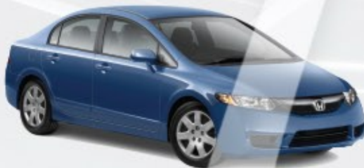
2010 Honda Civic LX